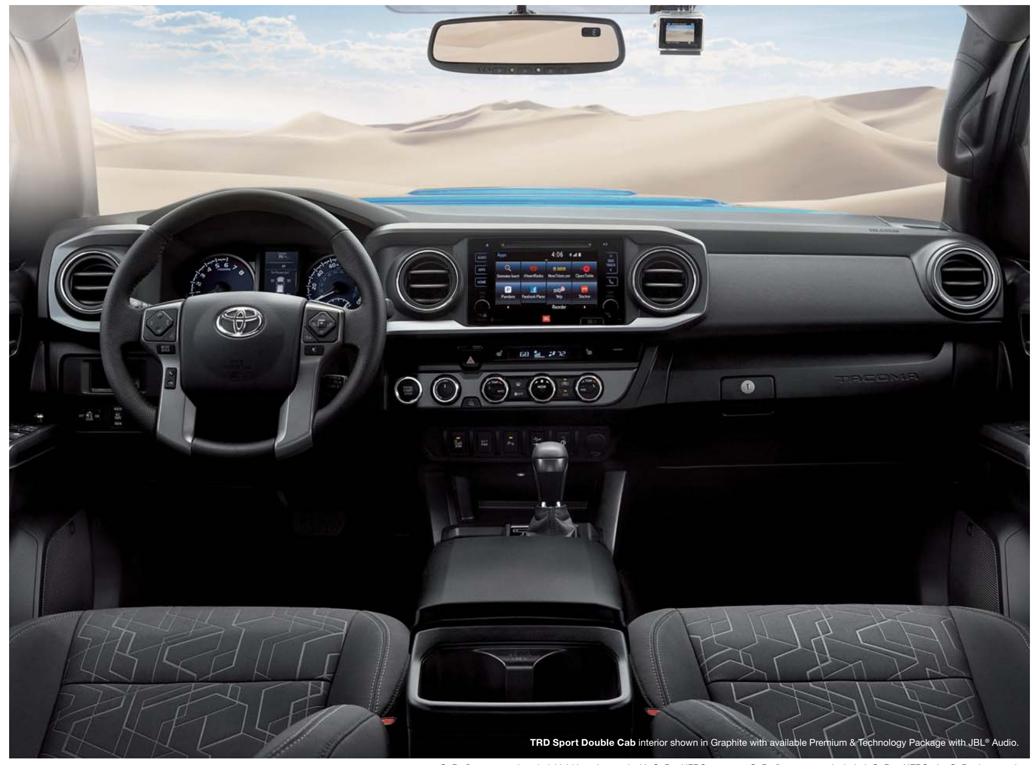
GoPro® mount on the windshield is to be used with GoPro HERO cameras. GoPro® camera not included. GoPro, HERO, the GoPro logo, and the GoPro Be a Hero logo are trademarks or registered trademarks of GoPro, Inc. Prototype shown with options. Production model may vary.