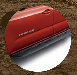
Cast-aluminum running boards