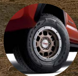
TRD 16-in. off-road beadlock-style wheels