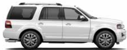
White Platinum Metallic Tri-coat

Exteriors This helpful guide is intended for selecting an exterior colour – not features, options or a trim level.