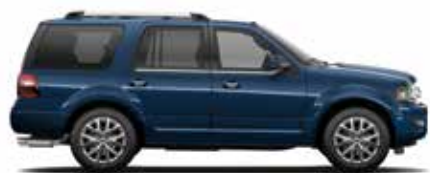
Blue Jeans Metallic