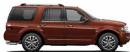
Bronze Fire Metallic