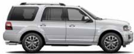
Ingot Silver Metallic