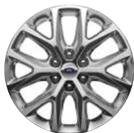
20" Polished Aluminum Standard