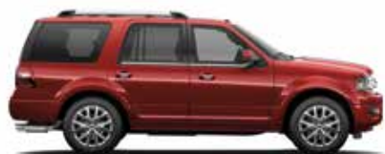
Ruby Red Metallic Tinted Clearcoat