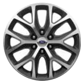
20" Bright-Machined Aluminum with Magnetic-Painted Pockets Optional

Ebony leather trim with perforated inserts. 2 Available equipment.