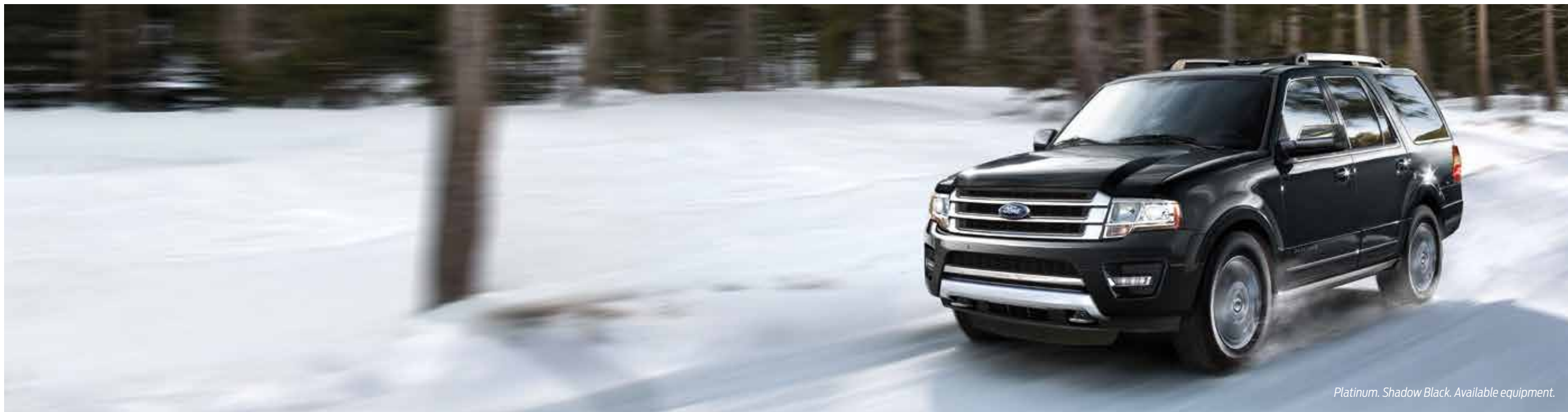
Platinum. Shadow Black. Available equipment.