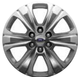
20" Polished Aluminum Standard