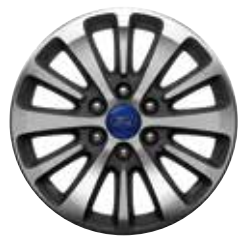
18" Bright-Machined Aluminum with Magnetic-Painted Pockets Standard