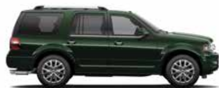
Green Gem Metallic