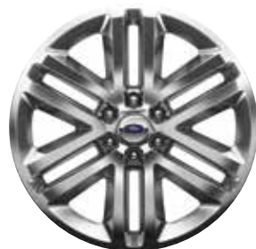
22" Polished Aluminum Optional

Brunello luxury leather trim with perforated inserts. SYNC 3. BLIS (Blind Spot Information System) with cross-traffic alert. Power-deployable running boards with polished stainless finish. 1st-row, 10-way power, heated and cooled bucket seats. Chrome liftgate appliqué with satin-aluminum finish accent bar.